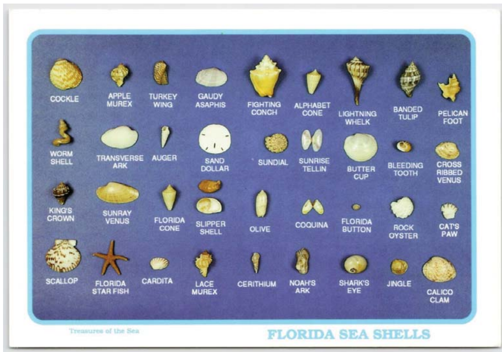
A recent postcard featuring Florida sea shells . . . do you have all of these?

Members will have chance to view all the boxes and vote for the ones they think are best. As mentioned before, this is a good chance to prepare for a shell show entry. It is easy and fun . . . just ask those of us who have done it. (I have mine done . . . ED)