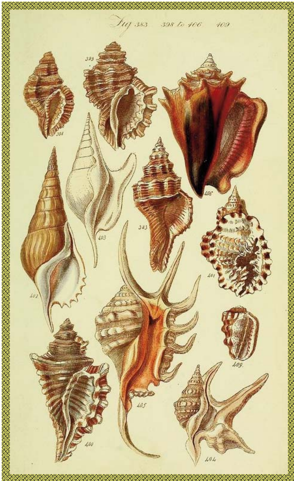
A page from Sowerby's 1839 A Conchological Manual.